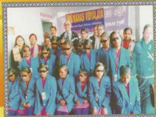
VISUALLY CHALLENGED STUDENTS HONOURED BY MVians